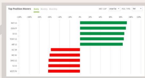
Top Position Movers