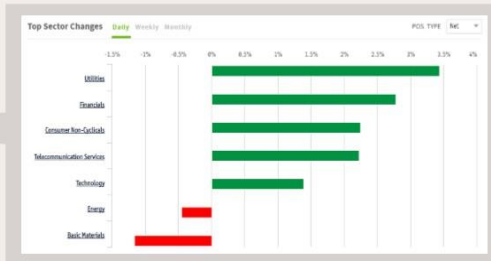
Top Sector Changes